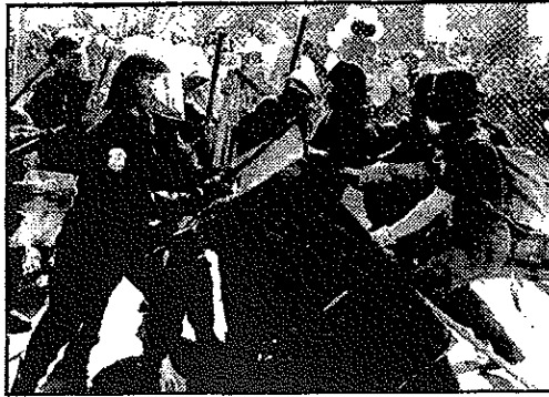
Quebec police clash with protesters after they broke through a fence protecting a summit of Western leaders in April.

Globalization protesters echo their parents' struggles in 1960s